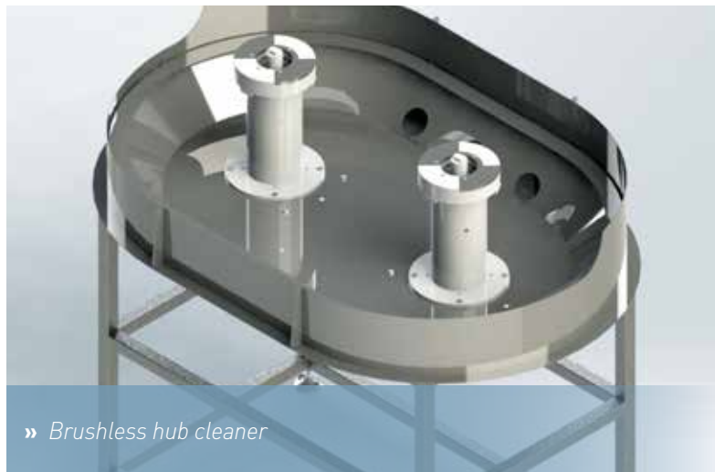
» Brushless hub cleaner